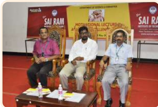
Motivational Lecture and Academic Excellence Award Function held on 03.05.2018