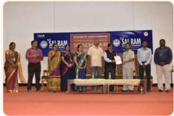
Technical Symposium : SIT-SCIHUM-18, held on 9.03.18.