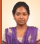
MITHRA S CSE - 13 th RANK