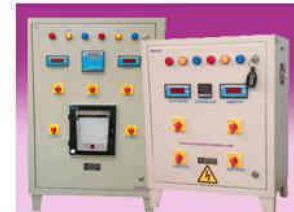
Furnace / Oven / Chambers