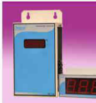
Digital Process Indicators