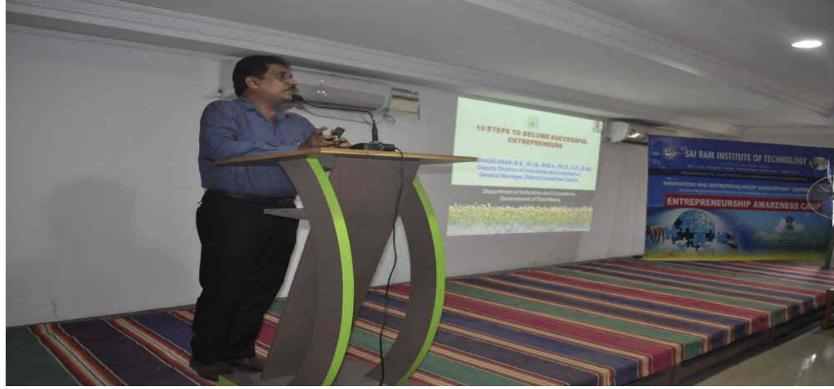
Camp Details published in News Paper